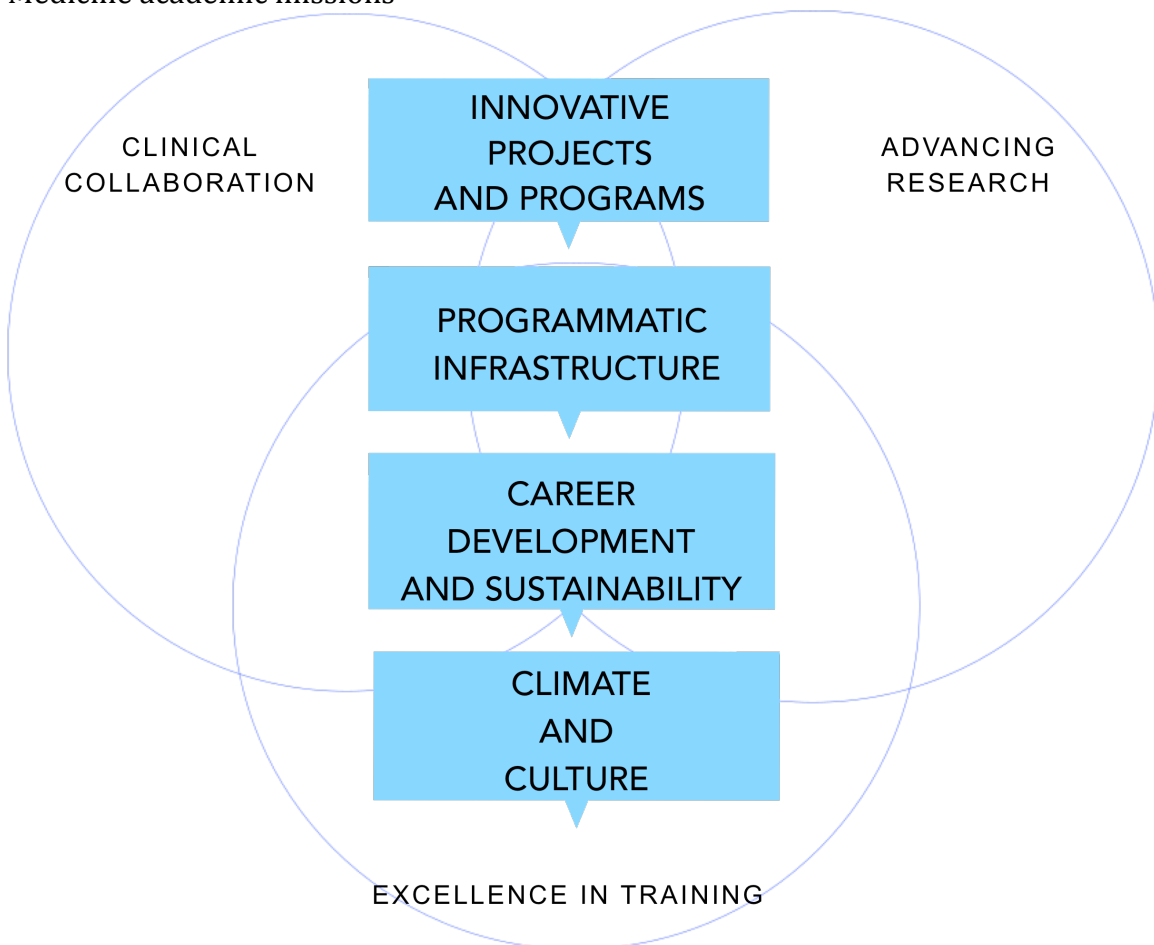
Figure 1. Strategic pillars for advancement of UACOMP Department of Internal Medicine academic missions

The missions of an academic medical center must continue to evolve and improve. Our strategic plan is designed on our strengths and values to achieve these goals.